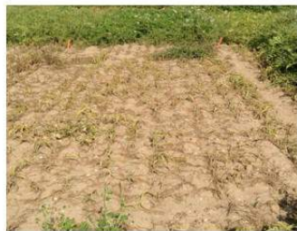
Milestone 7 fl oz/A POST