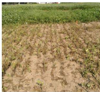
Plateau 12 fl oz/A + NIS POST