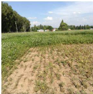
Roundup Power Max 22 fl oz/A + AMS POST