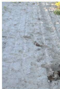
Metribuzin 75DF 2/3 lb/A applied postemergence