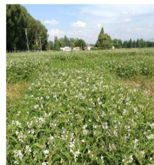
Matrix 1.5 oz/A + NIS postemergence