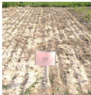
Chateau 1.5 oz/A applied preemergence