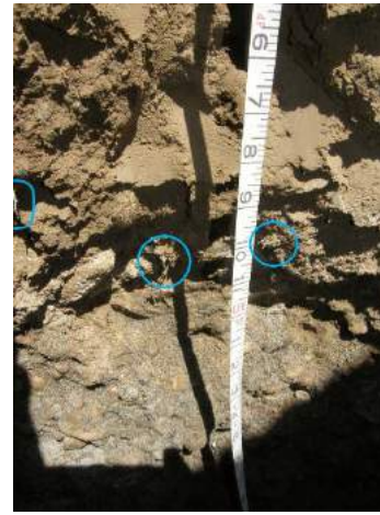
Roots down to gravel layer 5 ft depth

Flowering and fruit production. Besides the herbicides discussed above which stunt and prevent LT flowering, the plant growth regulator Ethephon was effective in reducing both flowering and fruit production in litchi tomato when sprayed three times over the summer at a rate of 16 oz/ac. The use of this growth regulator might help reduce the possibility of seed production and allow a slight delay in the date to mow down of the foliage. Use of those herbicides and/or this growth regulator would help reduce the possibility of seed production. Mowing down the foliage 8 to 9 weeks after emergence prior to seed set also would be an option.