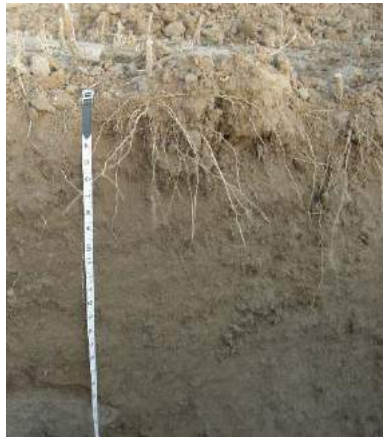
Top roots in first 1 ft