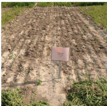
Metribuzin 75DF 2/3 lb/A preemergence