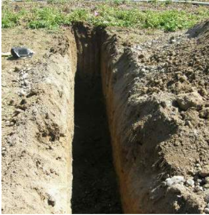
Rooting depth trial trench

Rooting depth. Soils in eastern ID can be gravelly and it's possible that PCN cysts may occur deeper in that soil type than in others. In a gravel soil site trial conducted in 2013, LT roots grew to the gravel layer even when it was 5 ft below the soil surface.