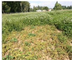
Starane 0.5 pt/A POST